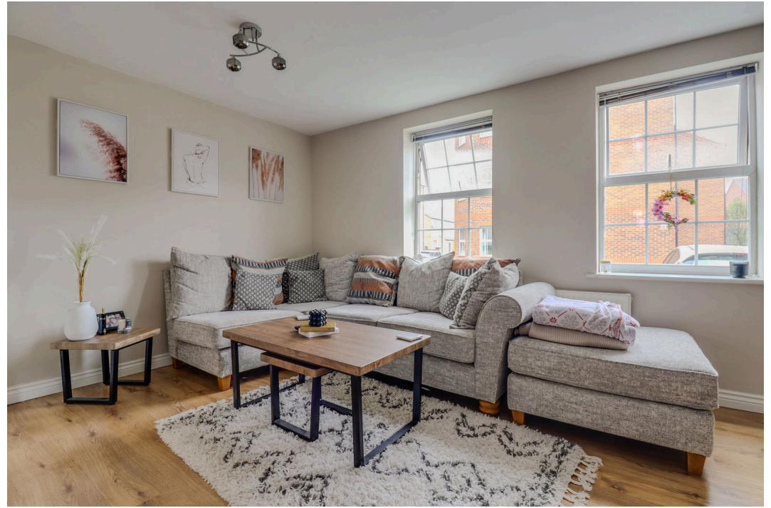
Bradgate Close, Sileby