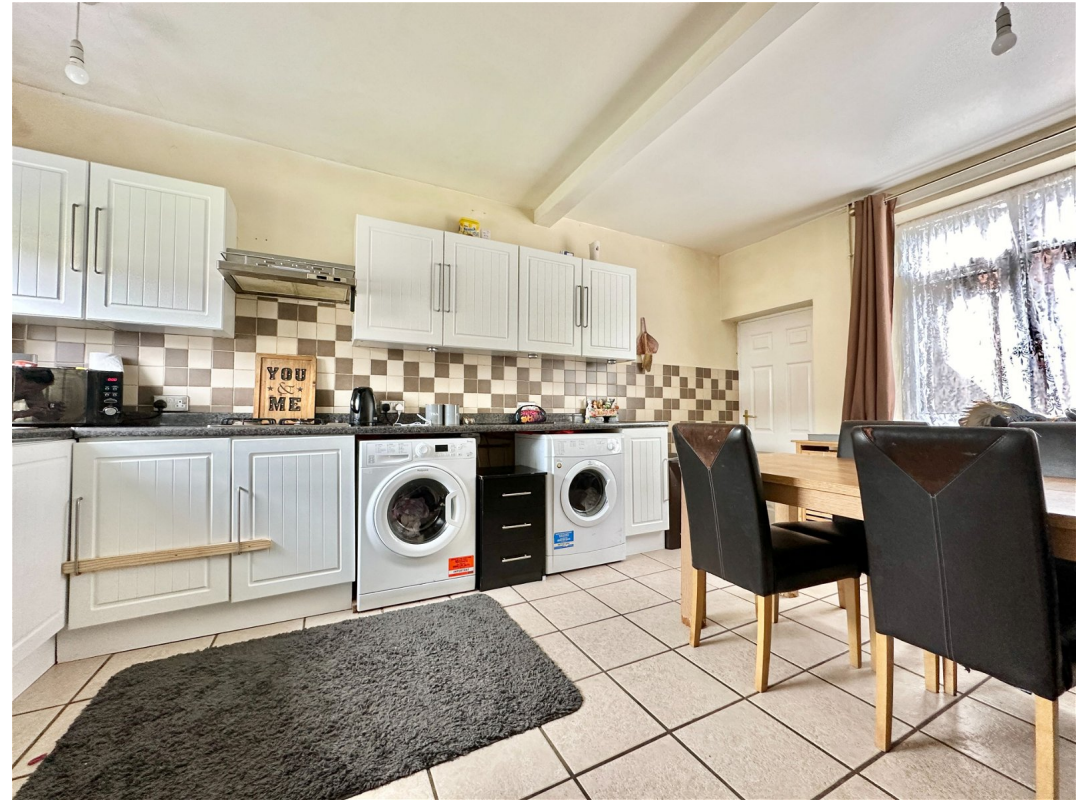
Aikman Avenue, Leicester