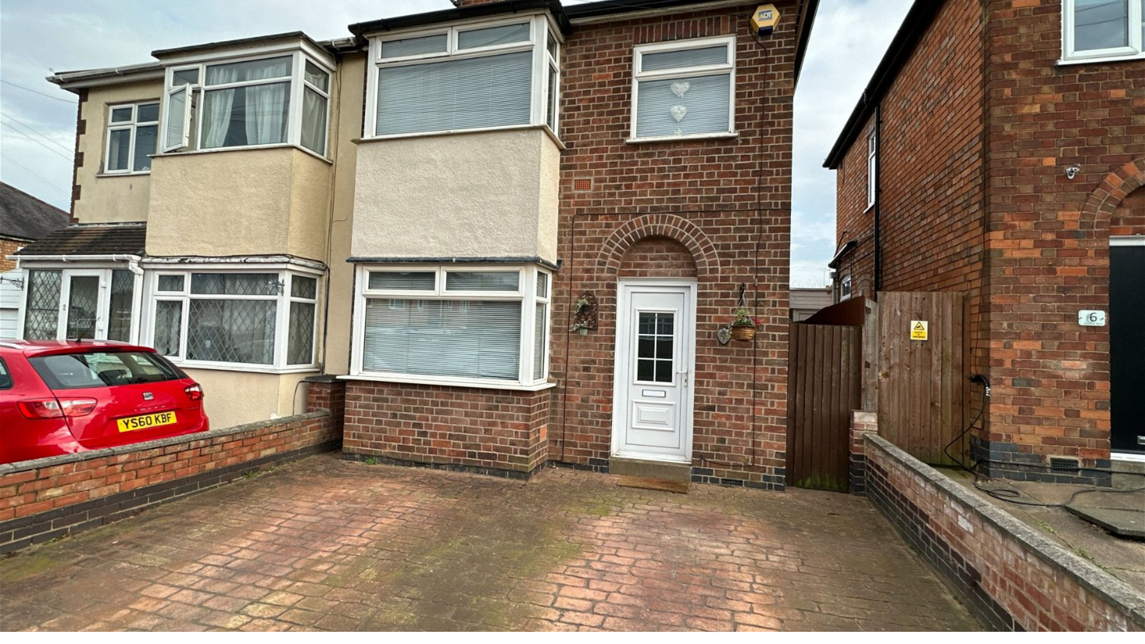
Leyland Road, Braunstone Town