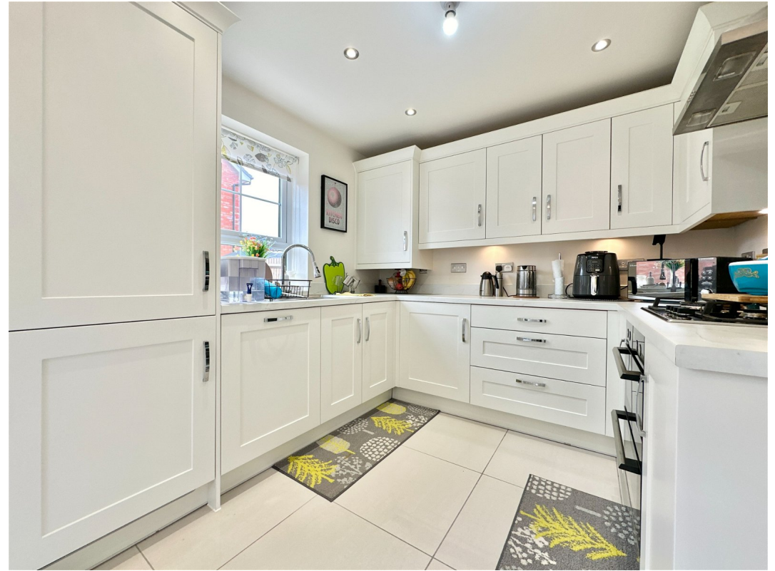
2, Shin Way, New Lubbesthorpe