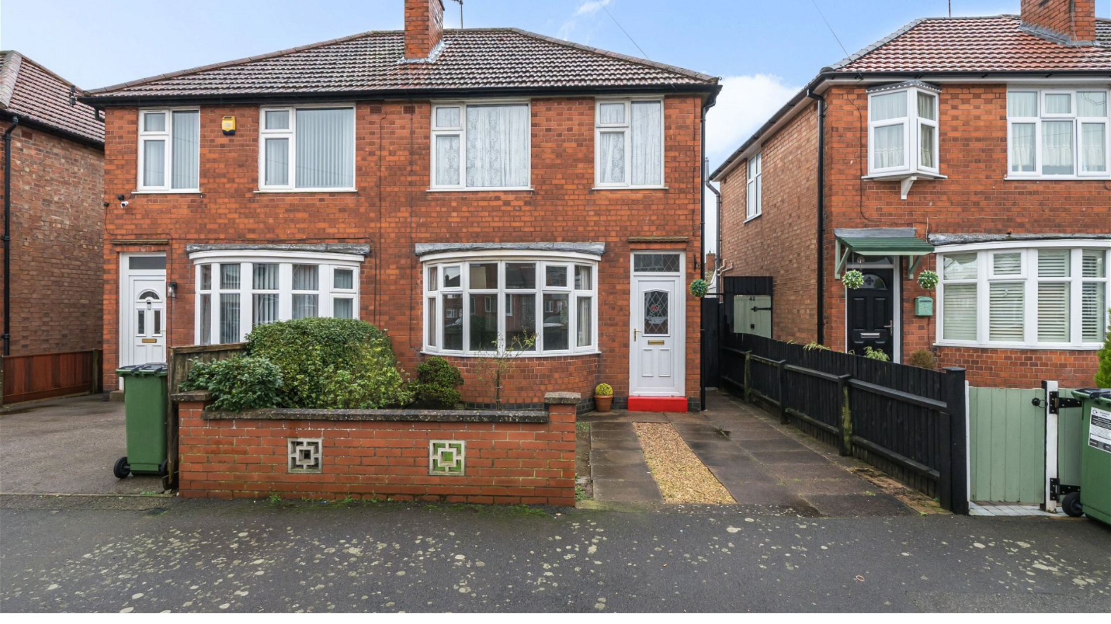
Shottery Avenue, Braunstone Town