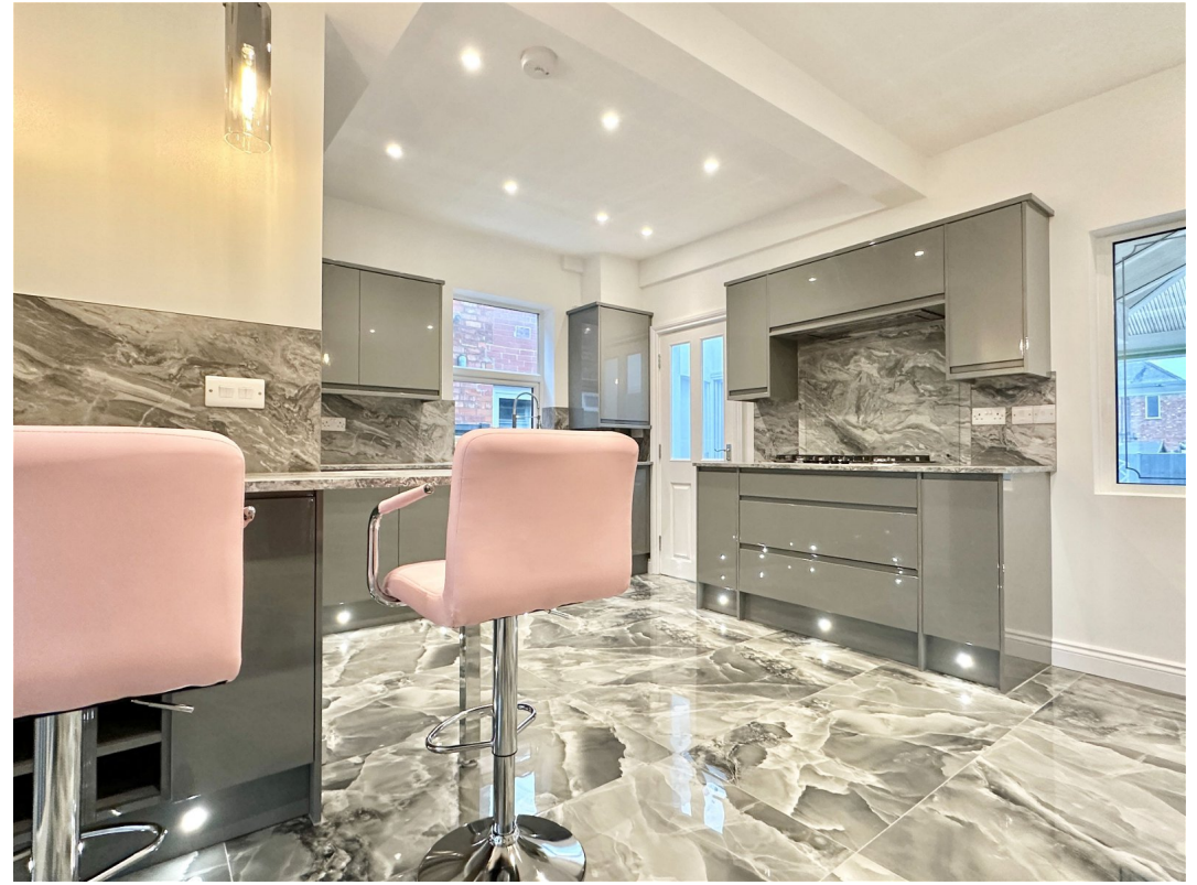
Meredith Road, Rowley Fields