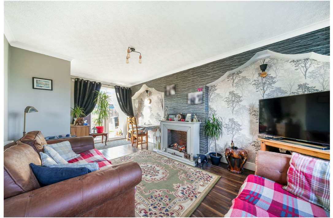
Cort Crescent, Braunstone