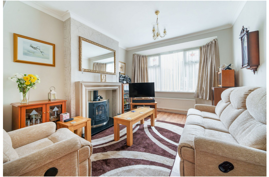
Melcroft Avenue, Western Park