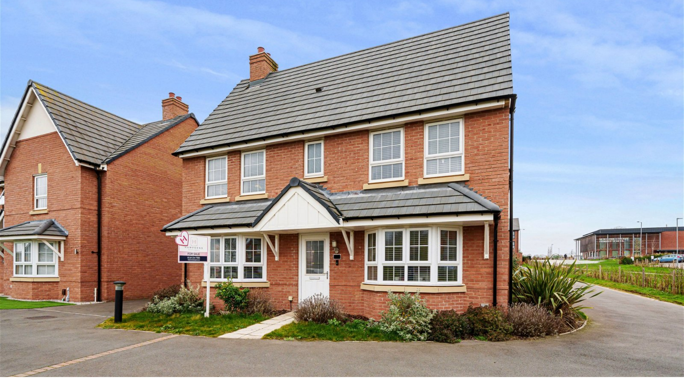
10 Beauly Place, New Lubbesthorpe