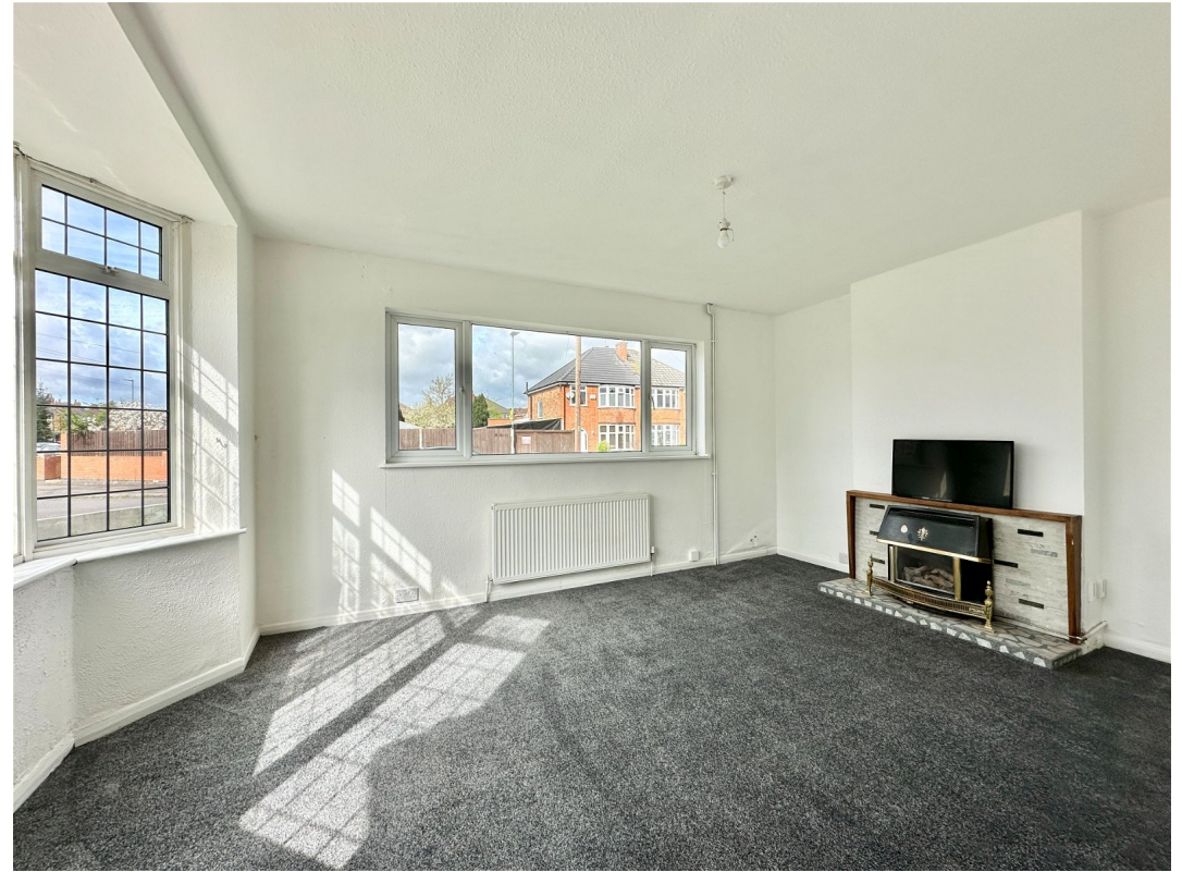
Braunstone Close, Braunstone Town