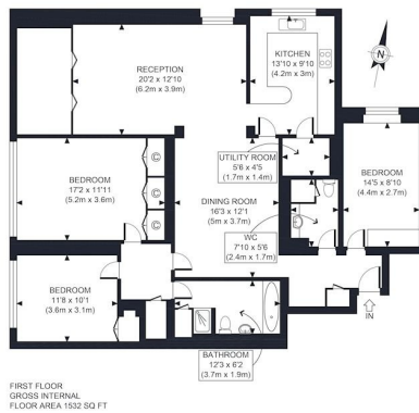
FIRST FLOOR GROSS INTERNAL FLOOR AREA 1532 SQ FT