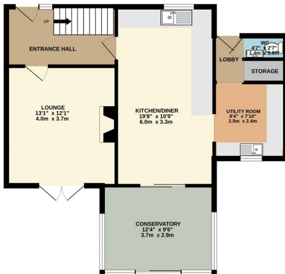
GROUND FLOOR 665 sq.ft. (61.7 sq.m.) approx.