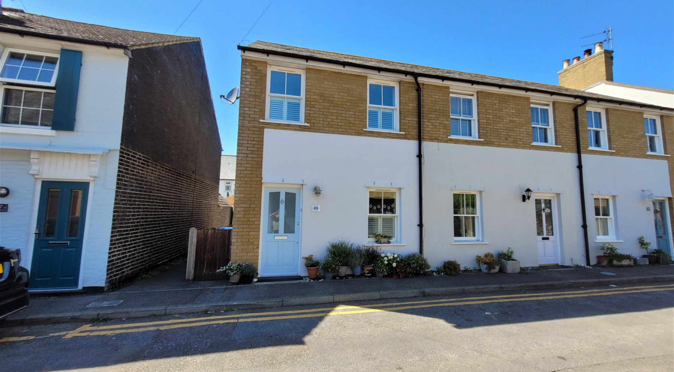
49 York Road, Walmer