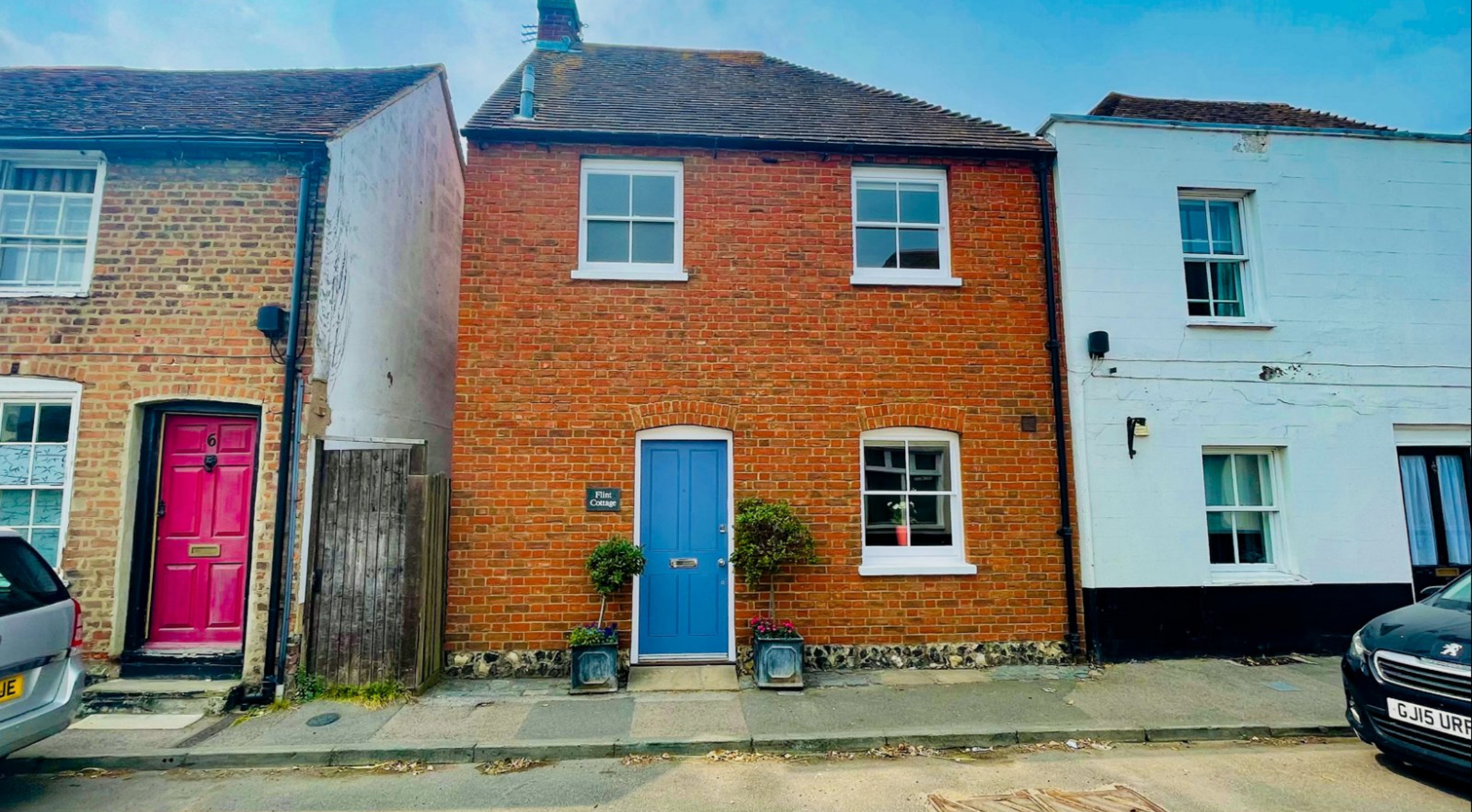
Flint Cottage,, 6a High Street, Eastry