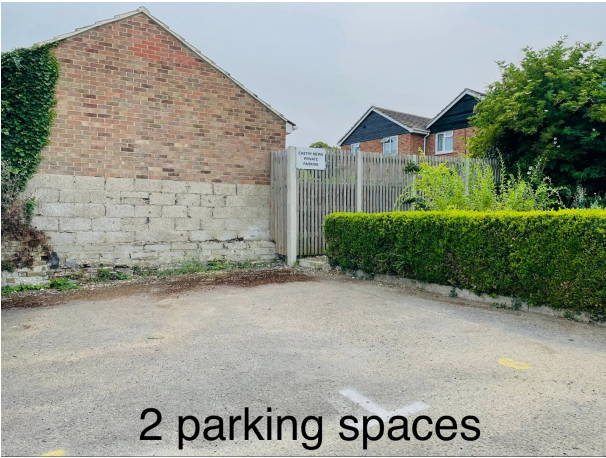
2 parking spaces