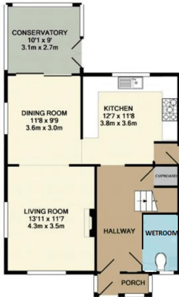
GROUND FLOOR APPROX. FLOOR AREA 679 SQ.FT. (63.1 SQ.M.)