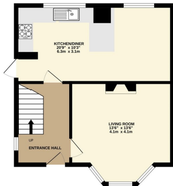
GROUND FLOOR 443 sq.ft. (41.2 sq.m.) approx.