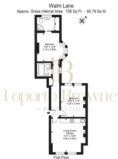
For Illustration Purposes Only - Not To Scale This floor plan should be used as a general guide for guidance only and does not constitute in whole or in part an offer or contract. Any intended purchase or lease should satisfy themselves by inspection, valuations, enquiries and full survey as to the correctness of each statement. Any errors, measurements or dimensions quoted are approximate and should not be used to value a property or be the basis of any sale or let.