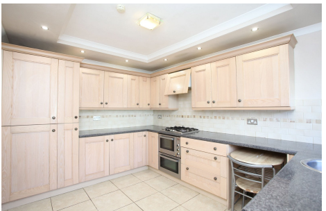
14 Llwyn On Street Guide Price £210,000