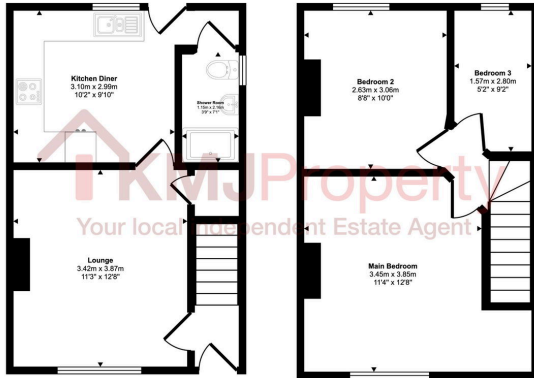
Ground Floor Approx 31 sq m / 329 sq ft

Approx Gross Internal Area 62 sq m / 662 sq ft