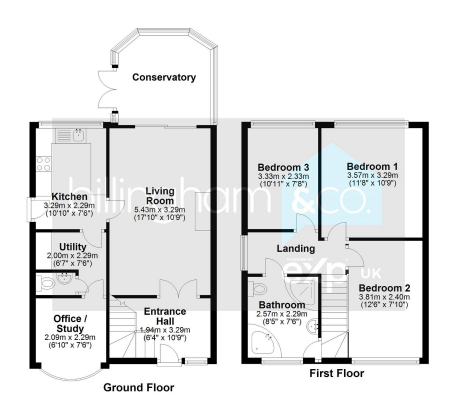
Andrews Close, Brierley Hill