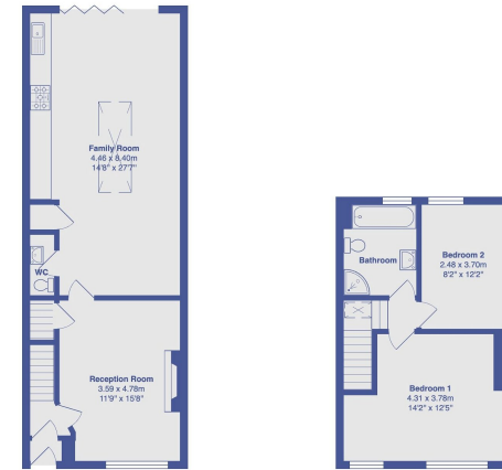
Conference Road, Abbey Wood, SE2 0YH Total Area: 96.1 m 2 ... 1035 ft 2 All measurements are approximate and for display purposes only