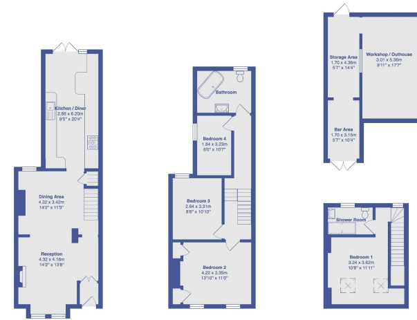
Abbey Grove, Abbey Wood, SE2 9EU Total Area: 117.8 m 2 ... 1268 Rf (excluding Outhouse / Workshop) All measurements are approximate and for display purposes only