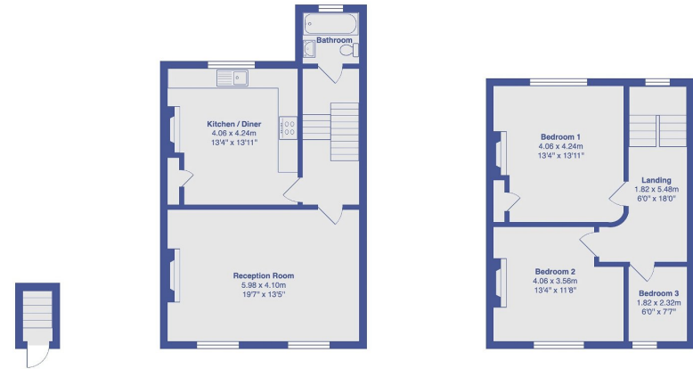
Glenton Road, London, SE13 5RS Total Area: 108.8 m 2 ... 1171 ft 2 All measurements are approximate and for display purposes only