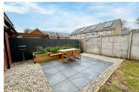
50% SHARED OWNERSHIP - A three-bedroom semi-detached home, occupying a superb position on the highly regarded Langford Fields development.