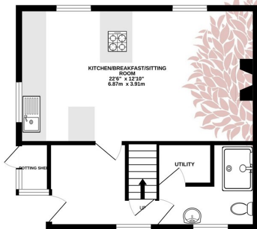
GROUND FLOOR 453 sq.ft. (42.1 sq.m.) approx.