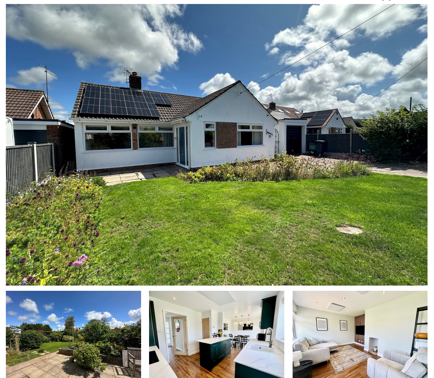
🍋 2 🚰 1 🚍 1

SUPERBLY RENOVATED - Tucked away down a cul-de-sac lane, is this beautiful detached twobedroom bungalow with separate single garage. The property is nestled within the beautiful village of Langford and offers a generous plot, and walking distance to many local amenities.