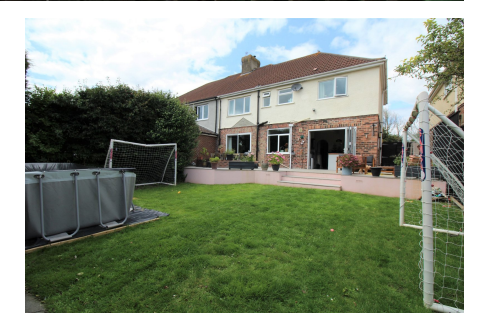
SUBSTANTIAL FIVE BEDROOM extended family home set within the popular Uplands area of Bedminster Down.