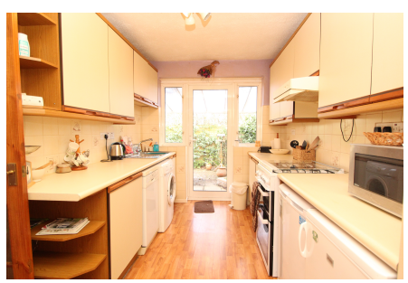
DETACHED BUNGALOW - A wonderfully positioned three bedroom detached bungalow situated in a lovely corner plot position, and enjoying easy access to local amenities.