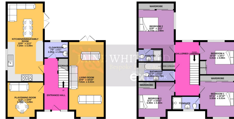
1ST FLOOR 777 sq.ft. (72.2 sq.m.) approx.

TOTAL FLOOR AREA: 1555 sq.ft. (144.5 sq.m.) approx. While every attempt has been made to ensure the accuracy of the floorplan contained here, measurements of doors, windows, rooms and any other items are approximate and no responsibility is taken for any error, omission or misstatement. This plan is for illustrative purposes only and should be used as such by any prospective purchaser. The services, systems and appliances shown have not been tested and no guarantee as to their operability or efficiency can be given. Made with Metreplan ©2021