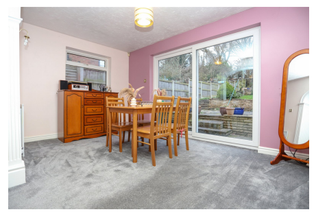
Please quote ref AT0132 An ideal family home on a highly sought after estate with amazing potential!