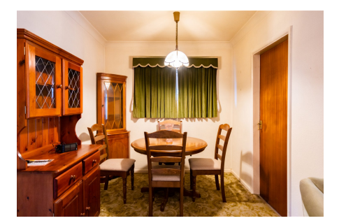
PROJECT SEEKERS ASSEMBLE - Who is looking for a fantastic project in Halesowen? Aaron Tonks presents Chapelhouse Lane - Please quote ref AT0132