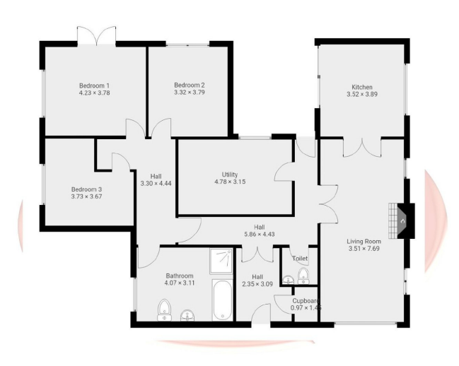
Lodge Abbey Road, WA10 6JX