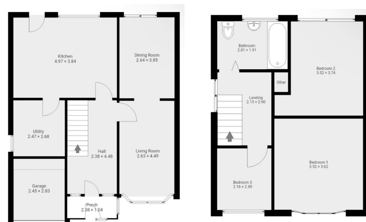
21 Penrith Crescent, L31 9BN

Alastair Saville present to the market this attractive, traditional, bow bay semi. The property has an extended kitchen, a modern bathroom suite and modern decor throughout. This property also has a LOFT ROOM and UTILITY ROOM Offering ideal family accommodation this, gas centrally heated and double glazed home can only be appreciated upon internal inspection.