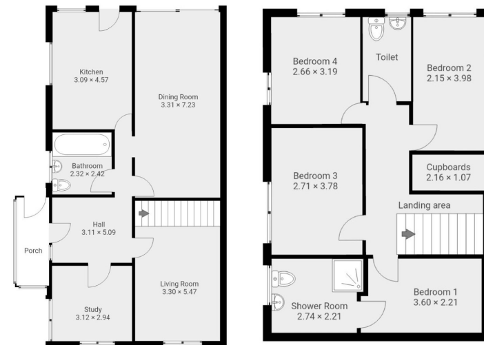
19 Andrew Street, L31 1BL

FOUR BEDROOM SEMI DETACHED HOUSE, MODERN KITCHEN, TWO SEPARATE RECEPTION ROOMS, STUDY, BATHROOM, ENSUITE TO MASTER, SEPERATE W/C, SPACIOUS DRIVEWAY, DETACHED GARAGE.