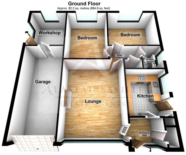
Total area: approx. 82.2 sq. metres (884.9 sq. feet) AEA (Aughton energy Jasseson) provide this Floor Plan as a guide to the overall dimensions of the property. Dimensions are approximate and to the provided are guide. Plan produced using Planty.